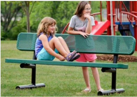
Free Bench (1266-1)

Cost: $9,295 plus free shipping, free 6' Bench (1266-1) Estimated Install Equipment Cost: $3,527 Engineered Wood Fiber: 61 Cubic Yards: Cost: $915 plus shipping approx. $450 Estimated Install for EWF: $915 Estimated Geotextile Fabric: $185 Estimated Install for Geo: $160 Estimated Site (37'x33') Excavation of 12" deep: $800 Estimated Community Build Cost: $2,500